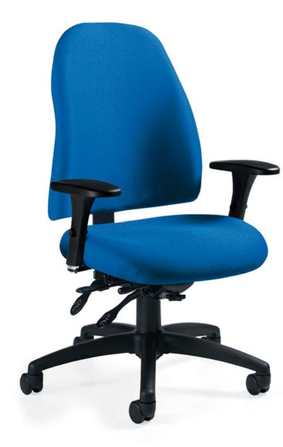
4434 Medium Back Multi-tilter. Wide seat and back shown with standard height / width adjustable G3 arm

The OBUSFORME® backrest support system has received an extraordinary level of support from the chiropractic community. It is the only such product endorsed by the Canadian Chiropractic Association, the Chiropractic College of Radiologists and Québec Association of Chiropractors. Endorsements have also been received from the Canadian Physiotherapy Association and the Back Association of Canada.